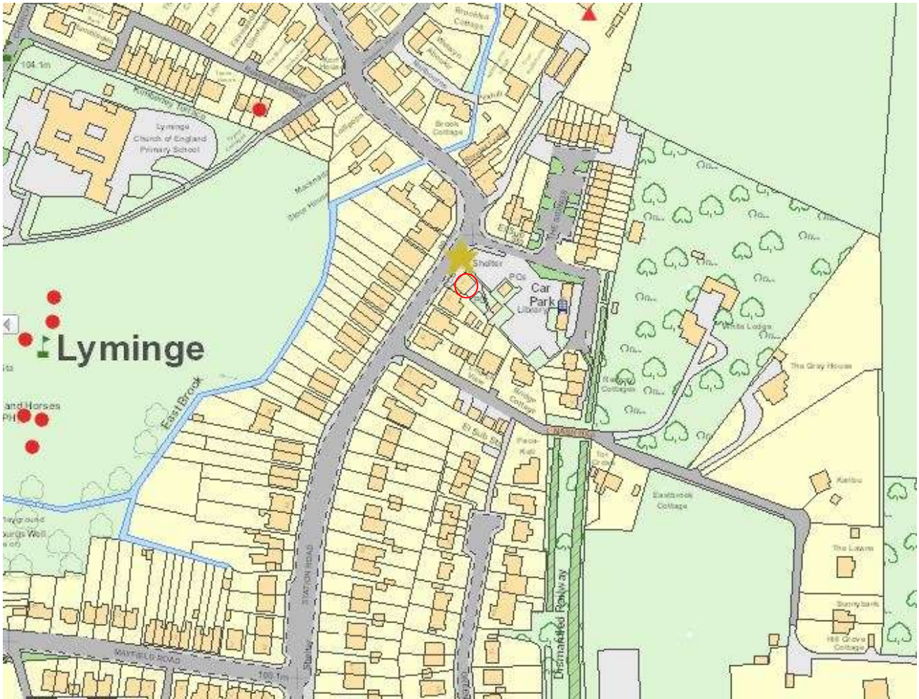
Figure 4. HER data (2018) (red circle denotes the site)