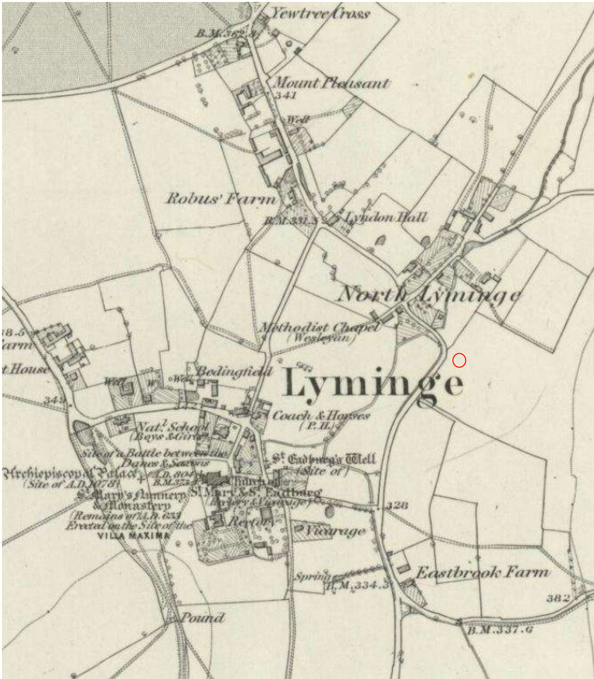
Figure 1. OS mapping c.1872 (red circle denotes the site)