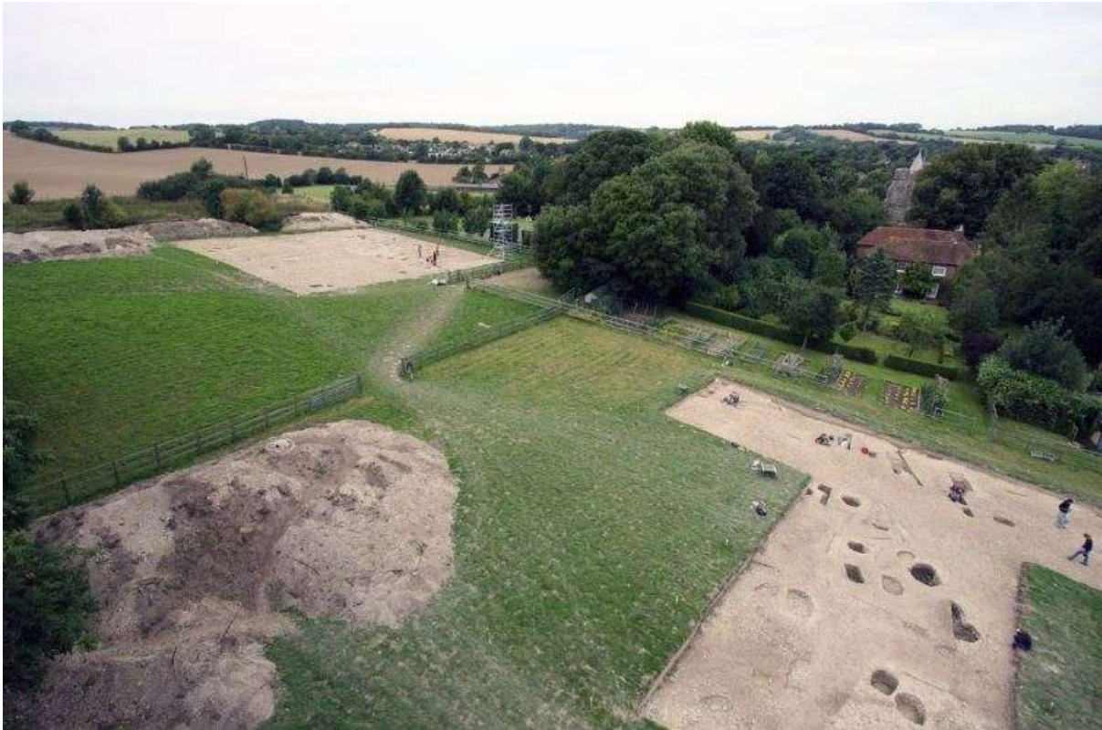
Plate 2. Recent excavations to the west of the PDA

the archaeological history of Lyminge starting with Canon Jenkins in the mid 19 th century and carried on by Dr Gabor Thomas in the 21 st century whose excavations show that Lyminge had its origins as an Anglo-Saxon 'central place' from the 5 th century AD onwards (Plate 1).