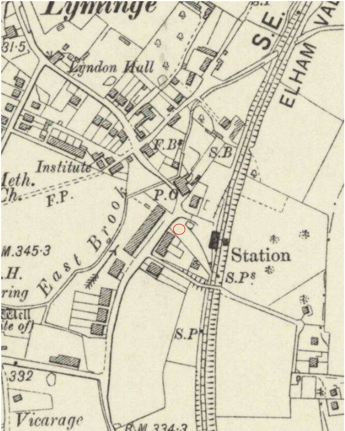
Figure 2. OS mapping c.1906 (red circle denotes the site)