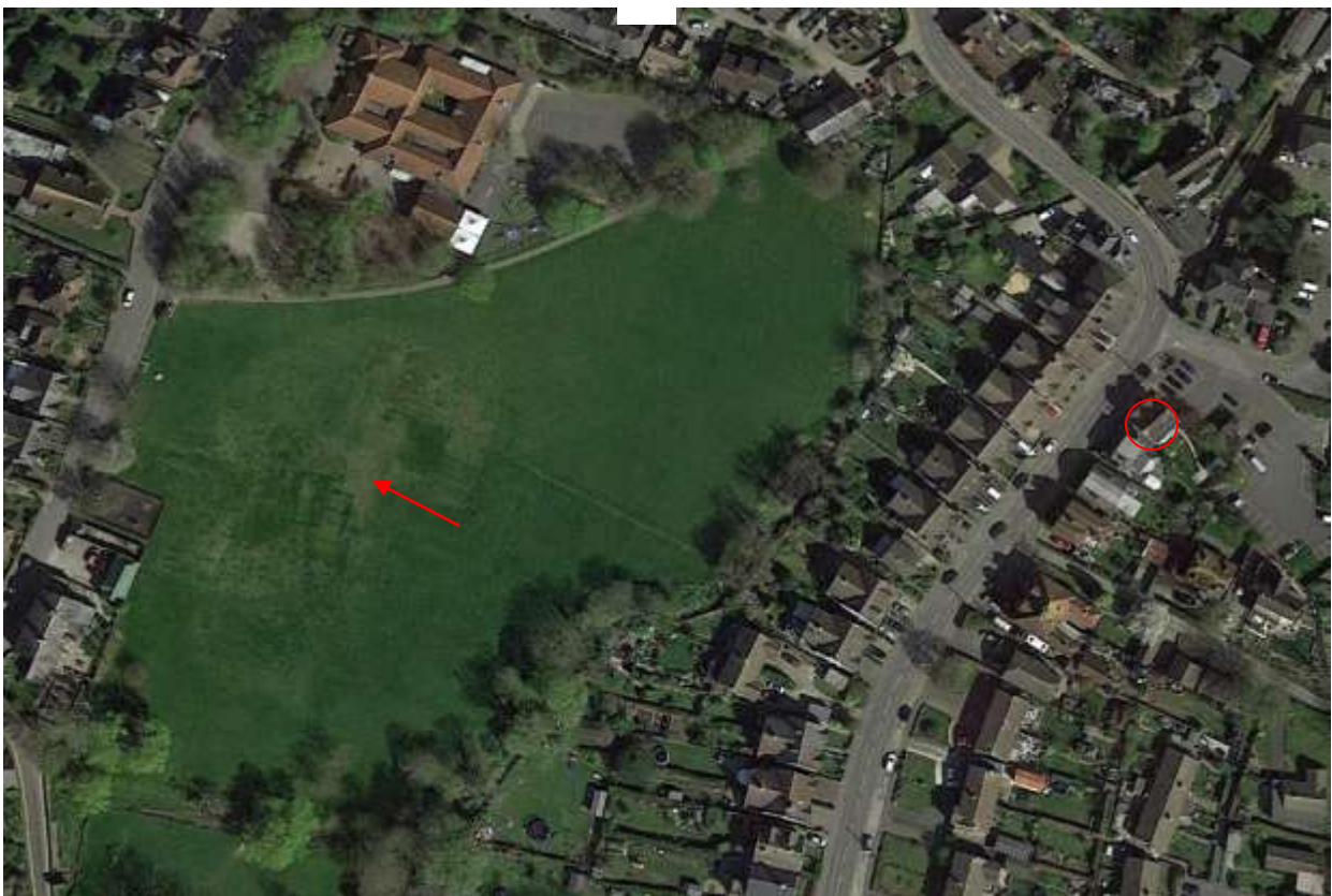
Plate 1. Aerial photo of Lyminge (2017) showing the Anglo-Saxon hall buildings to the west of PDA (red circle)